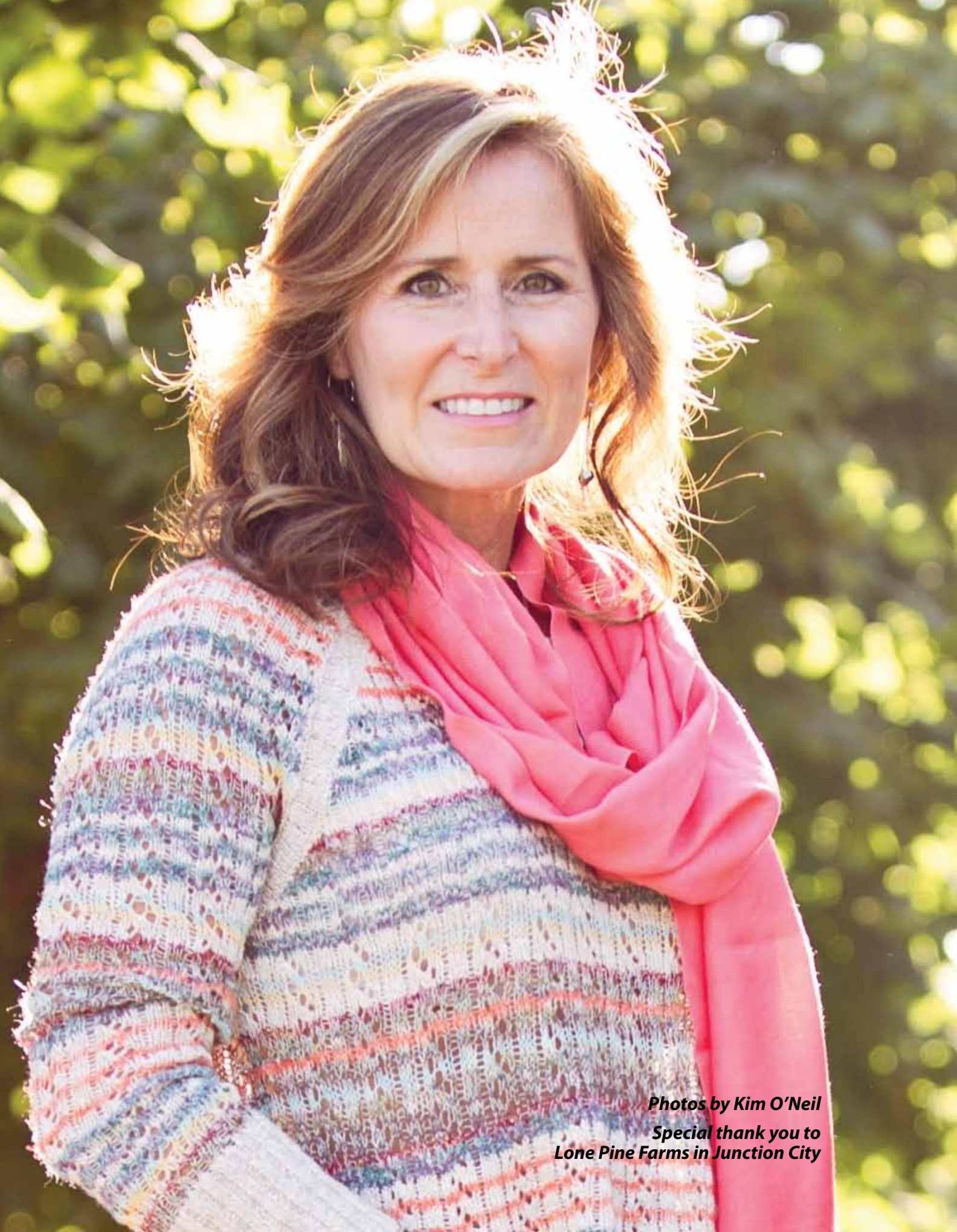
Special thank you to Lone Pine Farms in Junction City